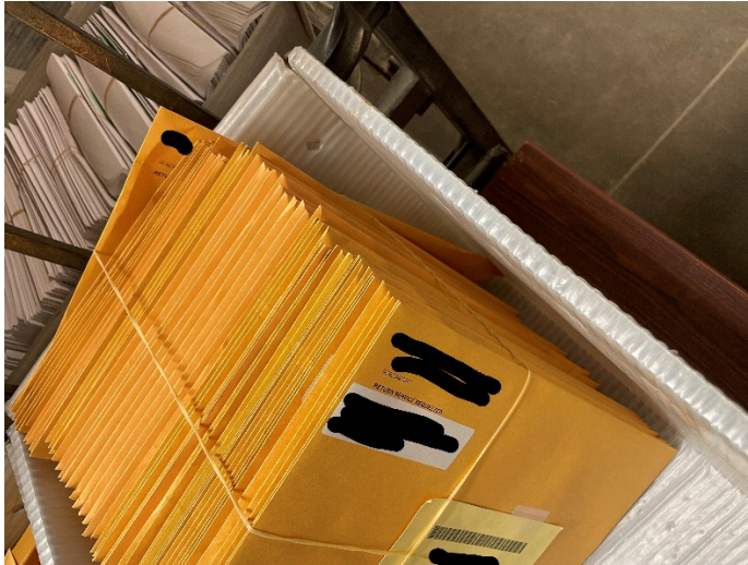
Examples of properly bundled flats (left) and letters. (below)