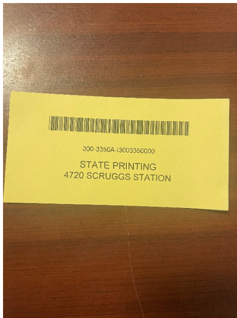
Example of Mailing Index Card (left)

Please avoid placing tape in postage meter area. (see below)